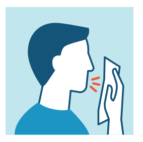
COVER COUGHS AND SNEEZES WITH A TISSUE OR FLEXED ELBOW, DISPOSE TISSUES